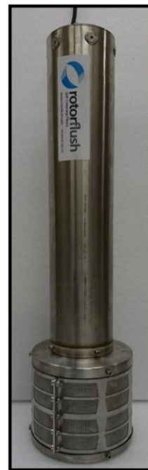
Above shows N99-16T Fitted with 315 micron Stainless Steel mesh