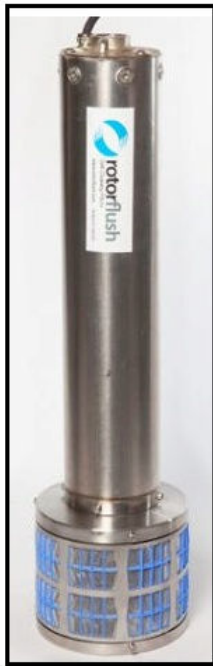
Above shows N99-16T Fitted with 300 micron nylon mesh