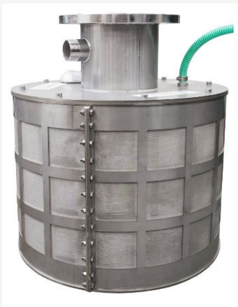
RF600-300AR 1mm woven steel mesh

*Approach velocity recommended for EPA 316(b) and Regulations for the Protection of European Eels