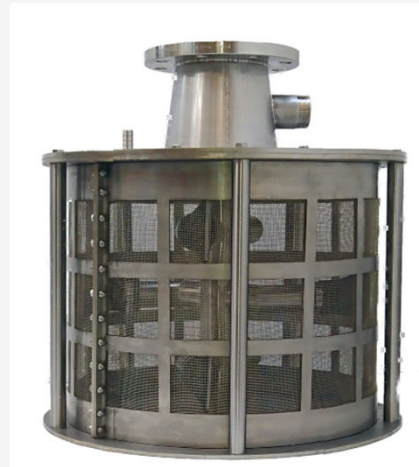
RF600-300AR with 2mm woven steel mesh and reinforcing