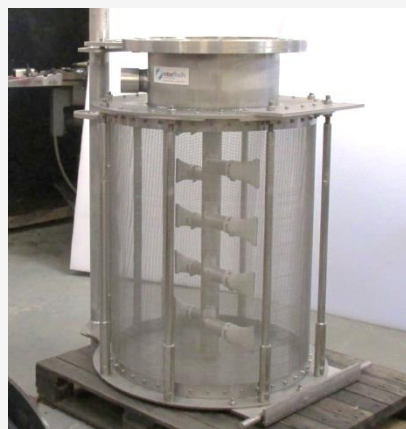
An RF800-900LW Eel Screen in