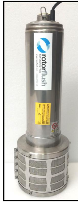
Above shows 4006-16M Fitted with 315 micron Stainless Steel mesh