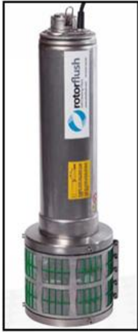
Above shows 4010-16M Fitted with 115 micron nylon mesh